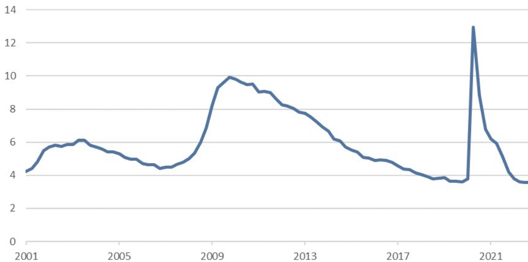
Fig. 4: US Unemployment Rate

On one hand, a strong labor market is good news as the economic goldilocks scenario for the US is that inflation dissipates without a recession. But on the other hand, the Fed sees inflation and unemployment as inexorably linked and believes unemployment needs to rise to 4.6% this year — roughly equal to 1.3 million lost jobs —to meet their inflation objectives.