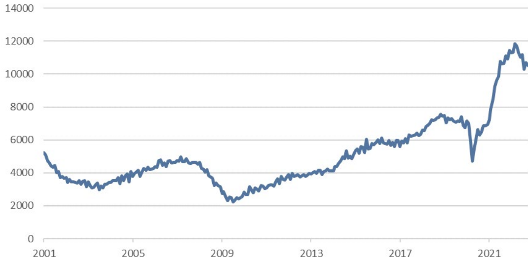
Fig. 2: Jobless Openings (thousands)